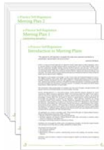
e-PS-R meeting plans