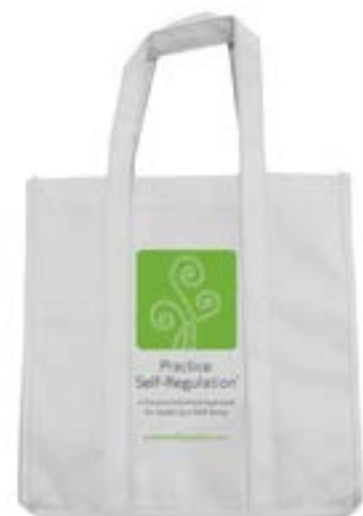
PS-R logo bag